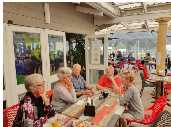
A great outing Morning Tea—Waldecks Nursery Cafe